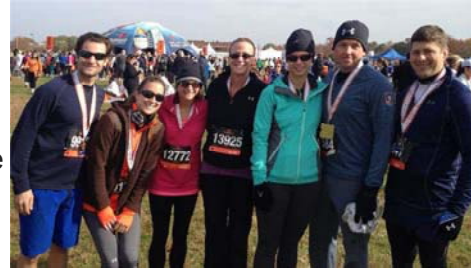
Post Members after the race

On Nov. 9, a team of 25 runners representing the SAME Baltimore Post participated in the 10K Across the Bay race. The Chesapeake Bay Bridge Run was a 6.2-mi jaunt starting near the base of the Chesapeake Bay Bridge on the western shore of the bay. The race took runners over the 4.35-mi bridge that towers nearly 200-ft above Chesapeake Bay.