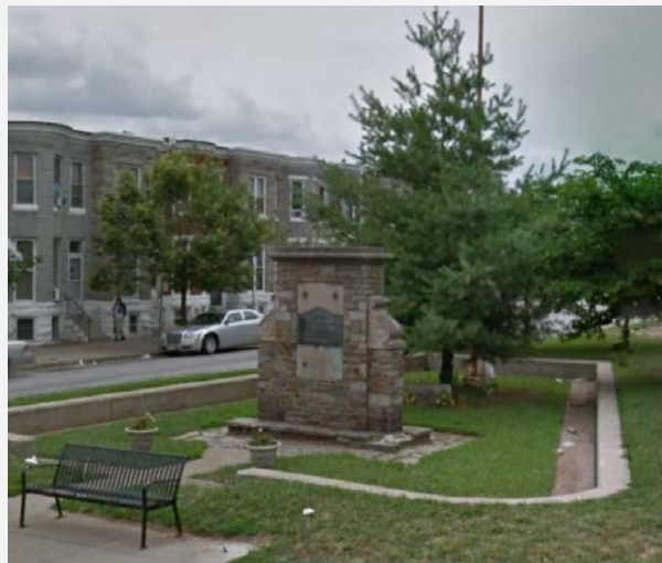
Mt. Clare Veteran's Memorial