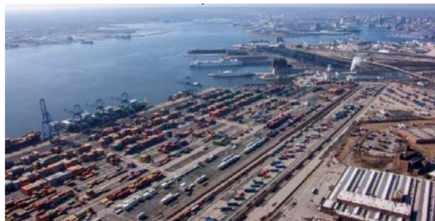
The Port of Baltimore