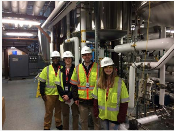
WBCM's students visit an ultrapure water treatment plant